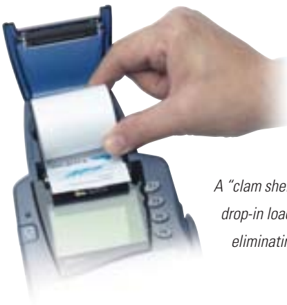
A “clam shell” printer facilitates drop-in loading, virtually eliminating paper jams.

Like all VeriFone terminals, the Omni 3700 family requires little training—saving hours of handholding and help desk time. The familiar interface puts needed functions at clerks’ fingertips. Lastly, the “clam shell” printer features trouble-free, “drop-in” paper loading to virtually eliminate paper jams.