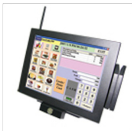
I-Button & MSR