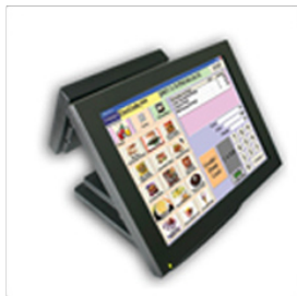
Rear Customer Display